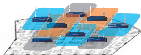
Cell-based WLAN Architecture

Extricom's Channel Blanket architecture enhances all aspects of wireless performance – coverage, throughput, capacity, QoS and mobility.