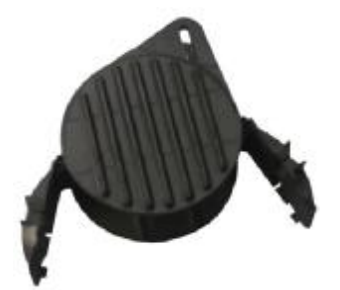
Protection box to be clipped on 5/35