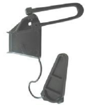
Drop wire clamp 5/35