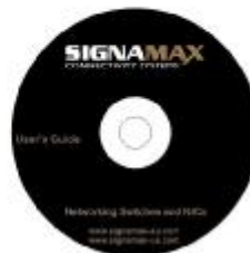
CD with User's Manual