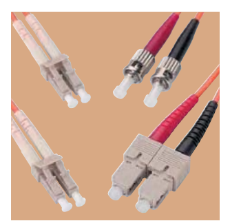
LC/ST (SC) Duplex