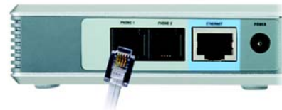
Figure 3-2: Connect the Telephone Cable

Proceed to the next section, "Placement Options," if you want to attach the Phone Adapter's base.