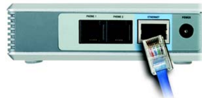
Figure 3-3: Connect the Ethernet Network Cable