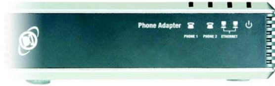
Figure 2-2: Front Panel

The Phone Adapter's LEDs are located on the front panel.