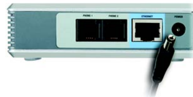
Figure 3-4: Connect the Power