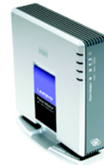
Figure 3-6: Phone Adapter Standing on Base