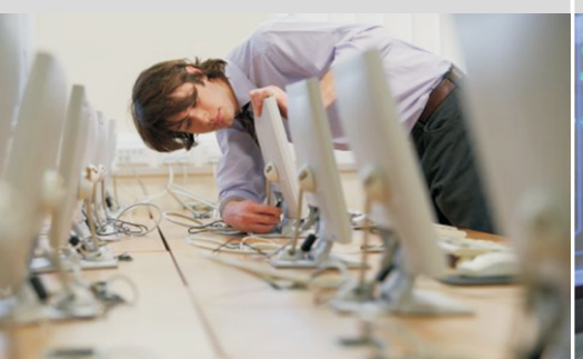
H igh Performance