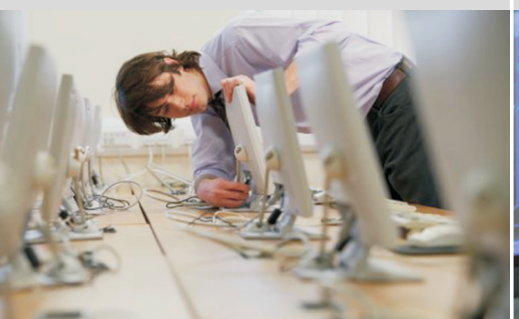
H igh Performance